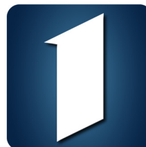
First Financial Bank Texas